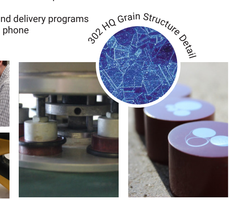
Material Sampling and polishing: product sample preparation for grain structure analysis and surface quality verification.

Customer service: in person, online or over the phone