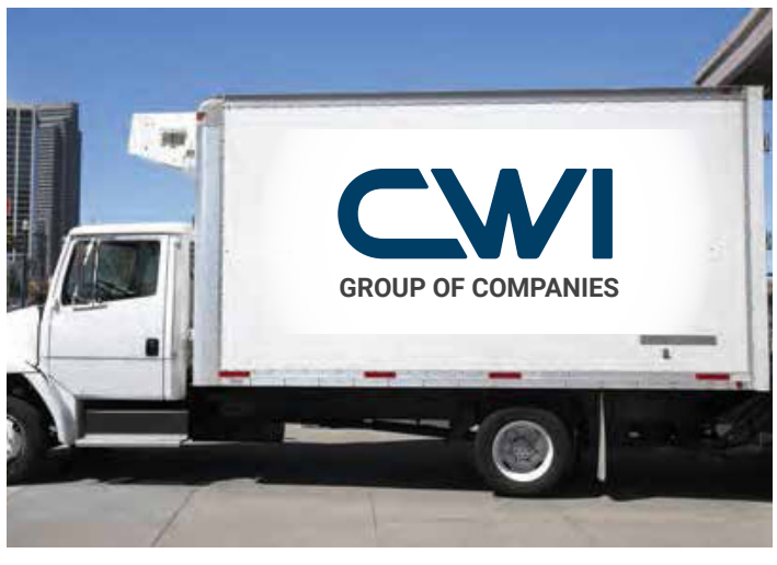
Fast and reliable shipping