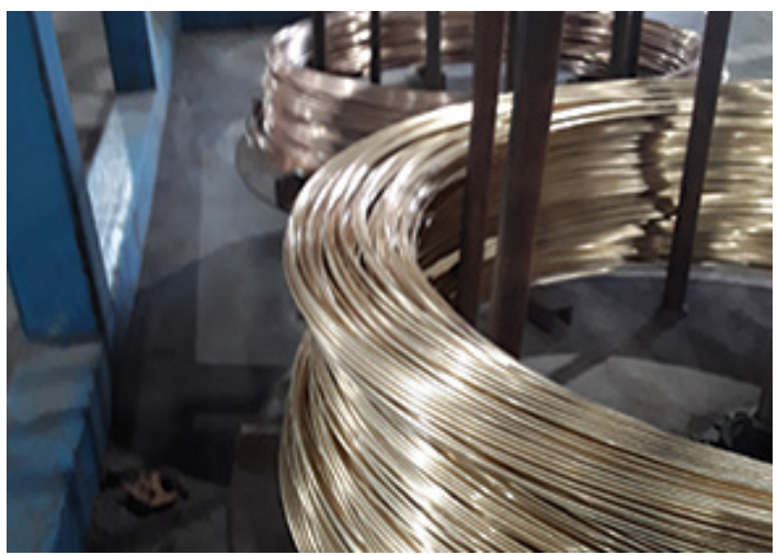
Cold heading wire