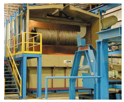
Acid pickling for oxide removal