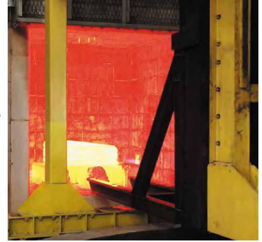
Batch annealing furnace