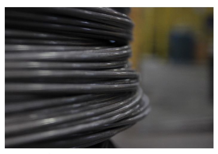
Copper coat and moly coat coils