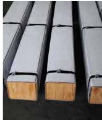
Various types of heavy duty packaging options for bar stock